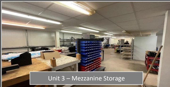
Unit 3 – Mezzanine Storage