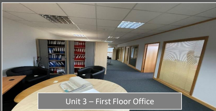
Unit 3 – First Floor Office