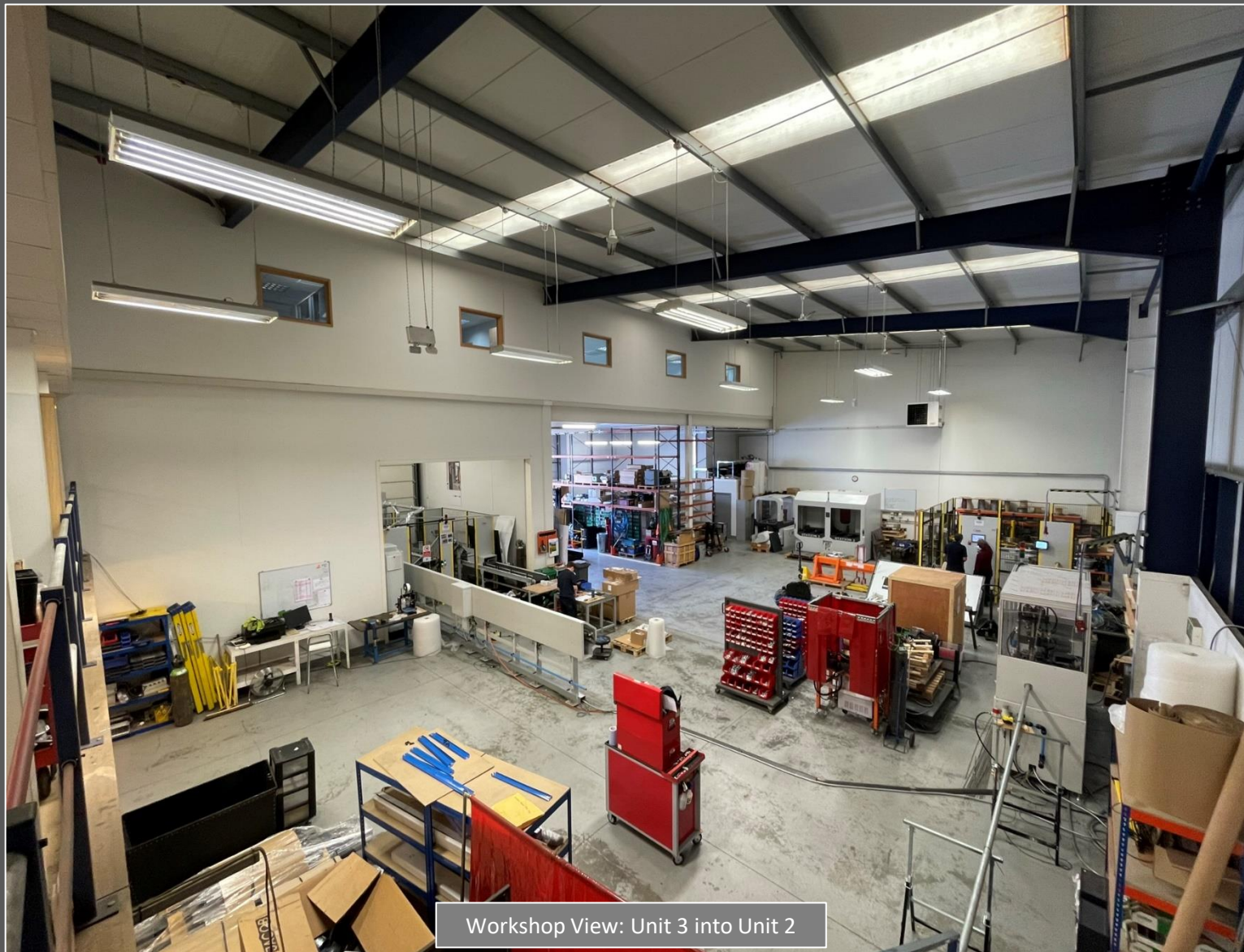
Workshop View: Unit 3 into Unit 2