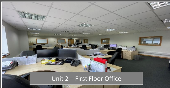
Unit 2 – First Floor Office